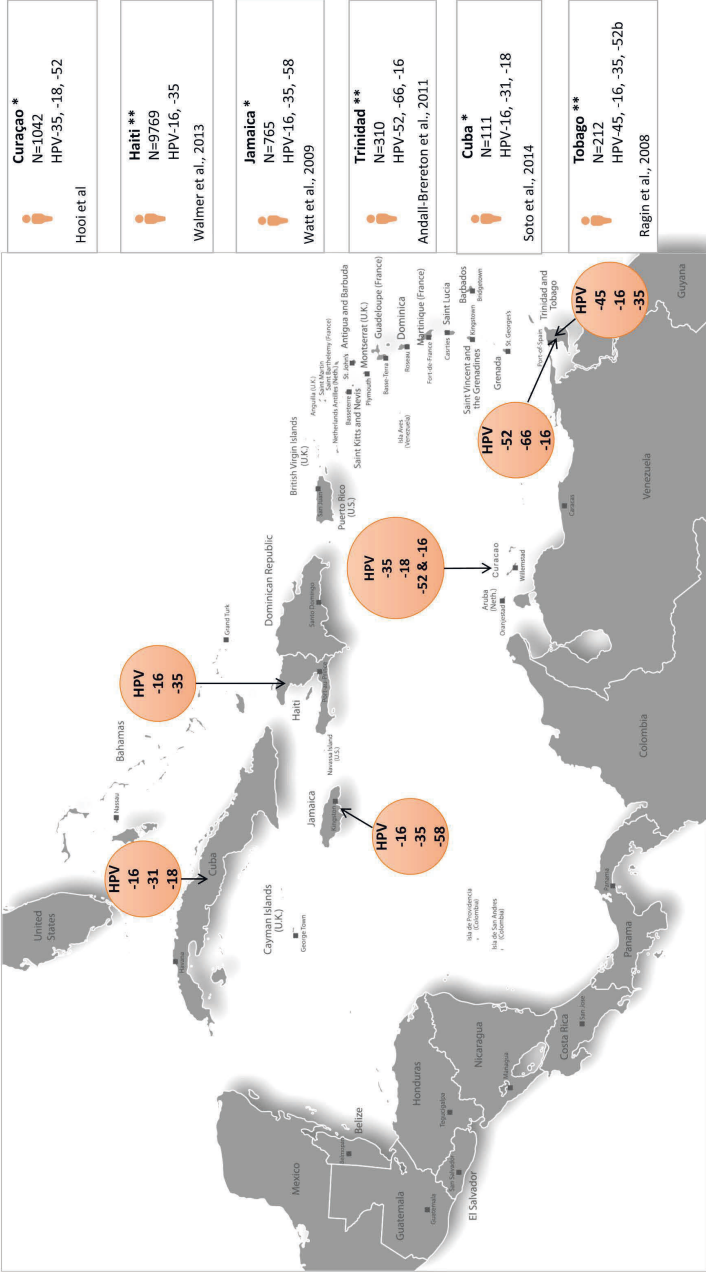
Figure 5.2 Illustration of the HPV type distribution in women with normal cytology.

Each study used different methods to: - gather the studied population, -determine HPV in lab, statistically analyse the results and to describe the data. Distribution of the most common HPV genotypes in Guadeloupe are not described in this figure as in the publication these are not specified. *HPV prevalence in population with normal cytology. **HPV prevalence in population with normal and abnormal cytology.