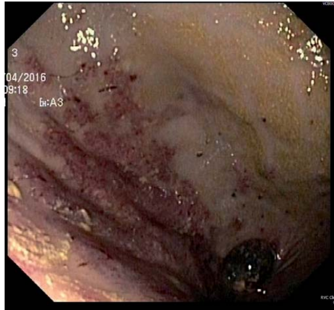
Figure 7.2 Erosive gastritis.

composed of eight individual spheres (Figure 7.3B). This morphology is characteristic of Sarcina ventriculi . Gastric and duodenal biopsies also showed Sarcina ventriculi on the surface epithelium. Helicobacter pylori and Giardia lamblia were not observed and there were no signs of celiac disease. Culture of the biopsies was negative, including that for Helicobacter pylori . We applied a eubacterial molecular detection technique, called IS-pro, which confirmed the presence of Sarcina ventriculi . Patient was treated with ciprofloxacin and metronidazole for ten days and symptoms of bloody stomach retention and hematemesis resolved completely within several days. Control esophagogastroduodenoscopy performed after six weeks showed complete healing of the gastric and esophageal mucosa. In the mucosal biopsies, Sarcina ventriculi could no longer be detected. Duration of follow-up was nine months, no recurrence of symptoms has been reported in this period.