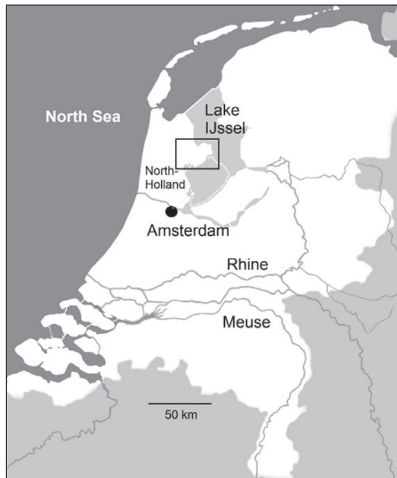
Figure 5.1 The area of the participating schools in the province of North-Holland, The Netherlands.

First of all, the flood-prone areas in the Netherlands differ enormously with respect to elevation, flood mechanism, flood protection and vulnerability and hence in necessary protective action. Besides, previous studies have shown that students in the Netherlands are well aware of flood risk in the Netherlands in general. But the optimistic bias is applicable to flood risk perception concerning their own surroundings (Bosschaart et al., 2013). Because of the location of the participating schools, the flood-risk education program of this study applies to West-Friesland, a region in the province of North-Holland (Figure 5.1). The program was designed with the characteristics of this region in mind and making use of information of the regional water board.